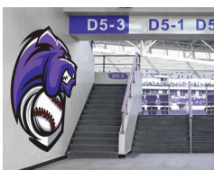
WHT-2AE 3.5 mil white PVC 2 mil clear 90# air-egress liner