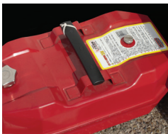
WHT-1CR 3.5 mil white PVC 1 mil clear 90# lay flat liner