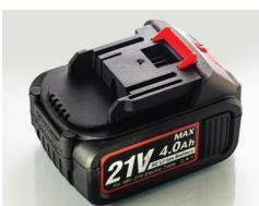
WHT-PET-2CR 2 mil white PET 2 mil clear 90# lay flat liner