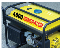
CLR-2CR 3.5 mil clear PVC 2mil clear 90# lay flat liner