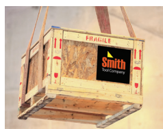
WHT-4HT 3.5 mil white PVC 4 mil clear 90# lay flat liner