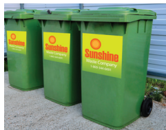
WHT-1HT 3.5 mil white PVC 1 mil clear 90# lay flat liner