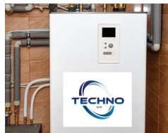
WHT-2HT 3.5 mil white PVC 2 mil clear 90# lay flat liner