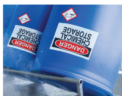
WHT-2CR 3.5 mil white PVC 2 mil clear 90# lay flat liner