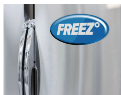
WHT-PET-1CR 2 mil white PET 1 mil clear 90# lay flat liner