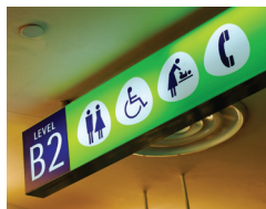
HTLSE-2 2 mil transfer 66# polycoated C2S liner