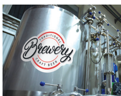
WHT-2AEG 3.5 mil white PVC 2 mil gray 90# air-egress liner