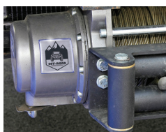
CHR-PET-1CR 2 mil chrome PET 1 mil clear acrylic 90# lay flat liner