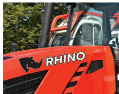
CLR-1CRAE 3.5 mil clear PVC 1 mil clear 90# air-egress liner