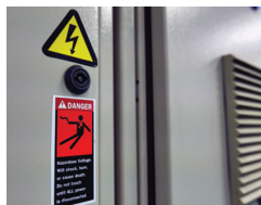
WHT-PP-1CR 3.6 white BOPP 1 mil clear 90# lay flat liner