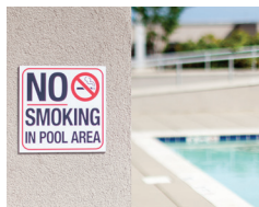
HTLSE-4 4 mil transfer 66# polycoated C2S liner

Stay connected with Jessup Manufacturing! Follow us on Facebook, Instagram, X and LinkedIn for the latest products, innovations, industry insights, exclusive tips, behind-the-scenes looks, and special offers. Connect with us today!