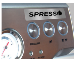
CHR-PET-2CR 2 mil chrome PET 2 mil clear acrylic 90# lay flat liner