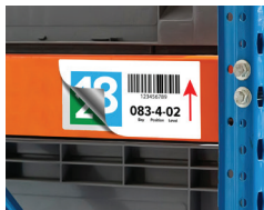
WHT-1CRG 3.5 mil white PVC 1 mil gray 90# air-egress liner