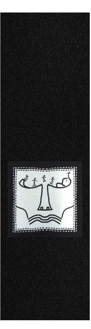
Skateface 3101-9x33-SKFACE (five 9"x33" sheets per Pack)