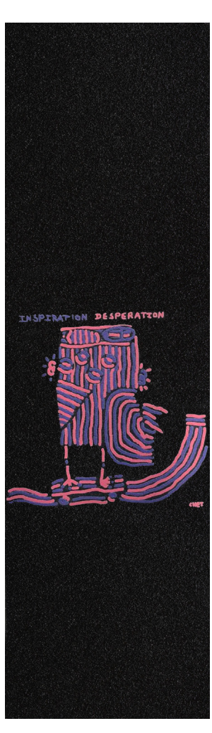
Inspirationdes 3101-9x33-SKBIRD (five 9"x33" sheets per Pack)